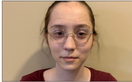
Faith - dietary aide