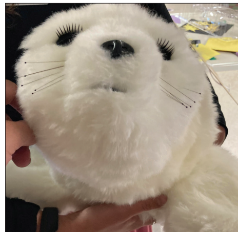
The new robotic seals add to the collection of animals being used in memory care at CHCC.

According to the company's website, PARO robots have sensors for touch, light, sound, temperature and posture. The robot can distinguish between light and dark, and it knows when it is being stroked or petted. The posture sensor helps the