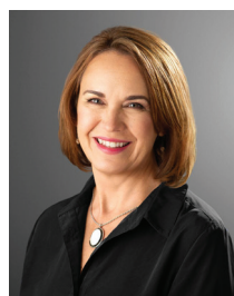
by Tonja Myers Administrator

They confirm that a signed media release is on file for each person who is included in the images or